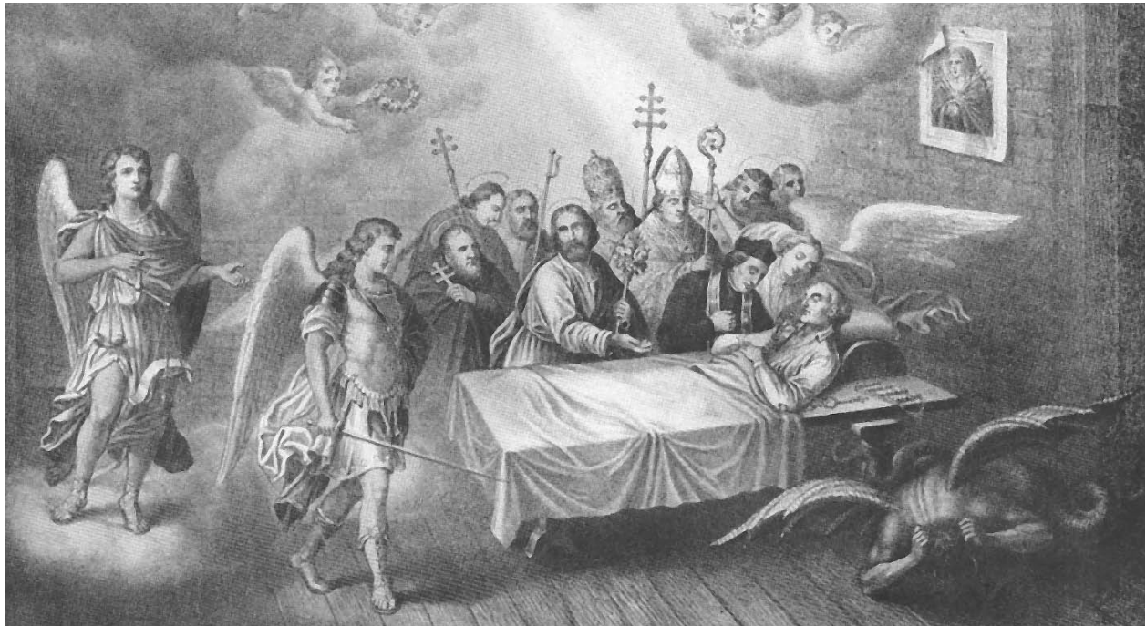
The Peaceful Death of the Just, 19th century lithograph

not force us to love him. He wants us to spend eternity with him — but the choice is ours. We have the chance to turn to Jesus while we are alive, but at the moment of death, our choice is frozen, suspended forever in time (see CCC 1021). We either die in friendship with the Lord or we die out of his grace, in persistent rejection of his love to the end. A person who dies in a state of mortal sin has made a tragic, yet free choice — and will spend eternity separated from God by his or her own choice.