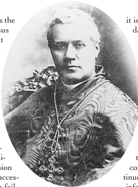
Pope St. Pius X, the first 20th century pope to be declared a saint

“For Jesus, Peter’s primacy is not a question of his human strengths or weaknesses.”